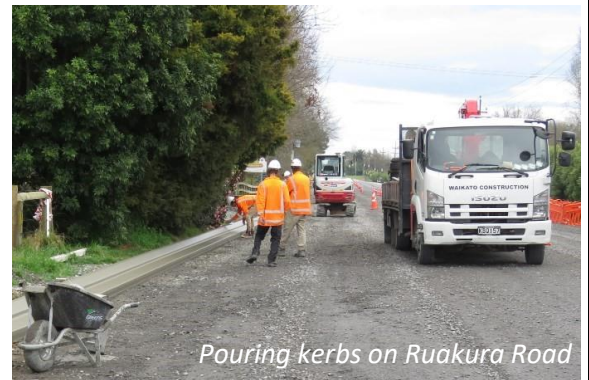
Pouring kerbs on Ruakura Road

Kerbs were poured outside LIC and Old Macdonalds Rural Education and Care Centre last week. Thanks for your patience while we worked on the local driveway accesses. Cement stabilisation will continue this week from the area north of the Vaile Road/ Davison Road Intersection towards the Old Macdonalds Rural Education and Care Centre. This should begin on Thursday. We expect this to take 4-5 days. Stop/slow will be in place during these works so expect delays. We will then seal this section of the road—stop/slow will be in place for these works also. Landscaping works will continue along the edge of the road.