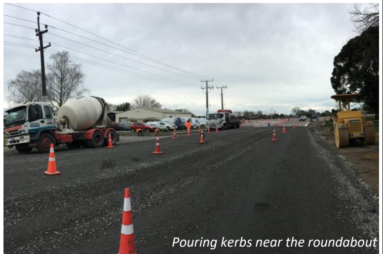
Pouring kerbs near the roundabout