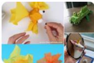
Egg carton crafts